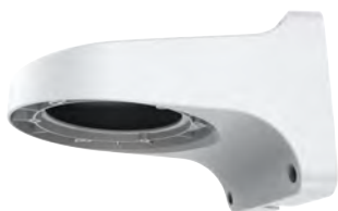
A29 WALL MOUNT