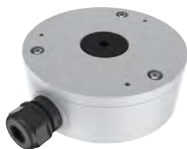
TC-P54BM SPEC: V5 JUNCTION BOX